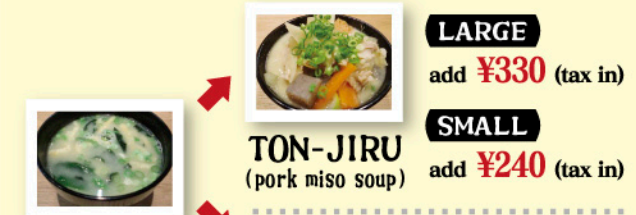
Miso soup (normal: ¥0)

LARGE add ¥330 (tax in) SMALL add ¥240 (tax in) TON-JIRU (pork miso soup)