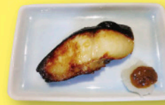
Grilled sablefish seasoned with sweet rice wine