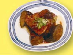
Eggplant miso stir-fry